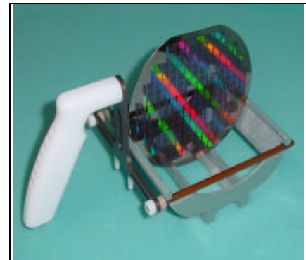
Tine Style for SiC Boat