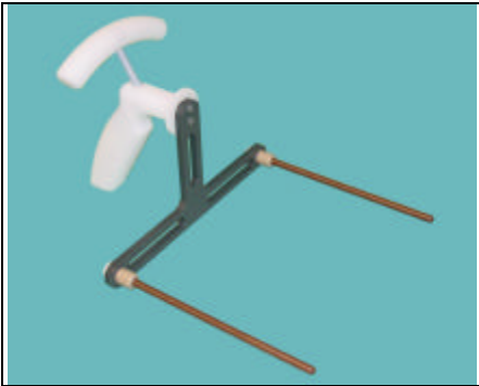
Tine Style for 200mm Quartz Boat