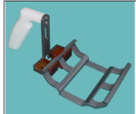
Clamp Style for SiC Boat